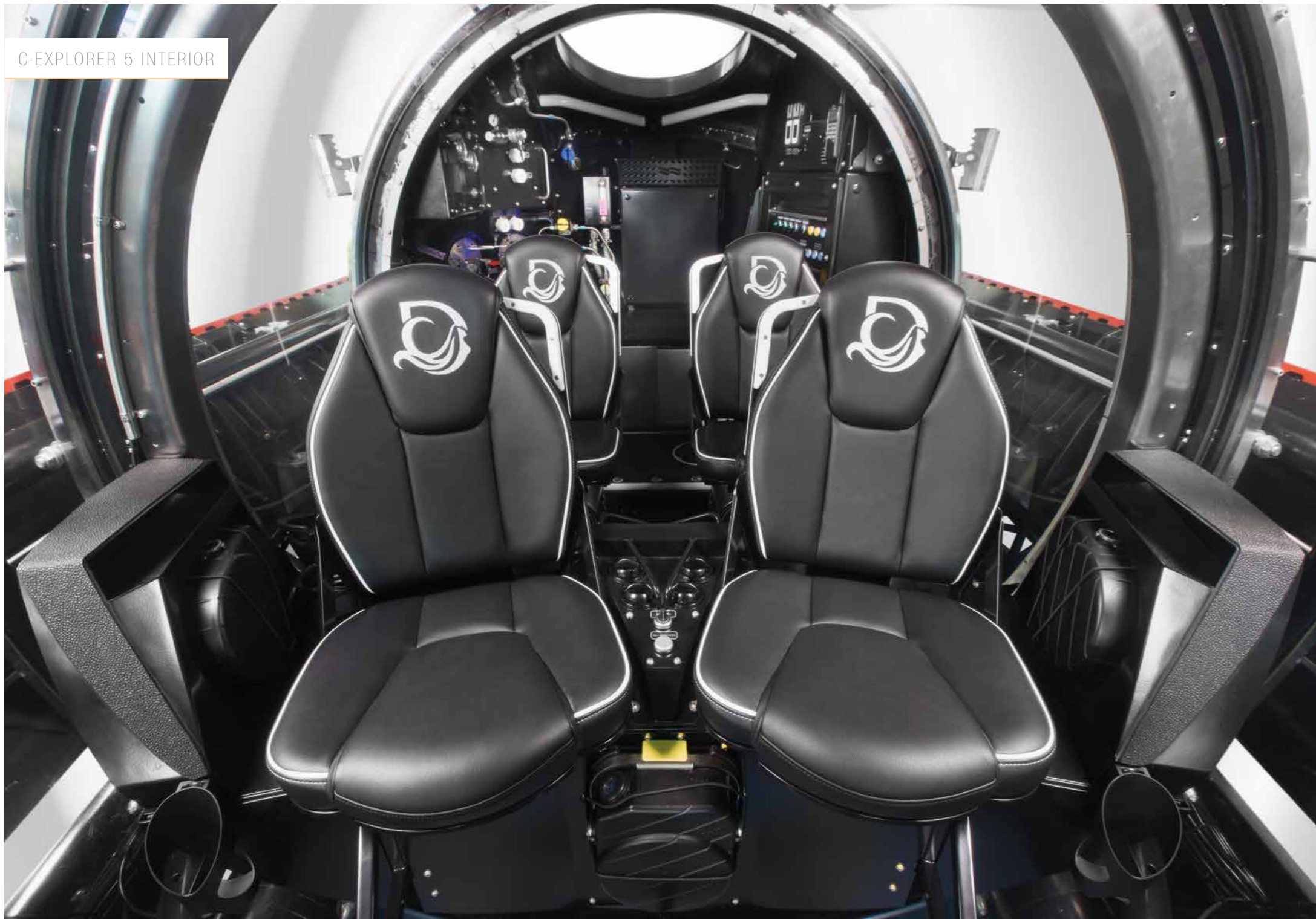
C-EXPLORER 5 INTERIOR